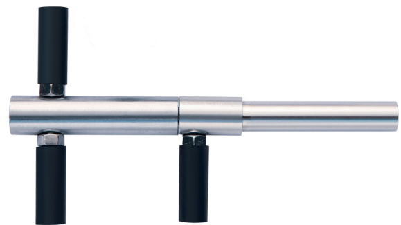
INNER SETTING TOOL