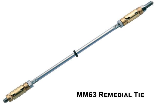
MM63 REMEDIAL TIE